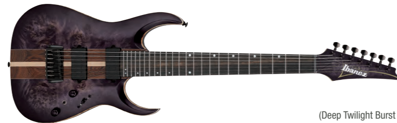
Premium DRL (Deep Twilight Burst Low Gloss)