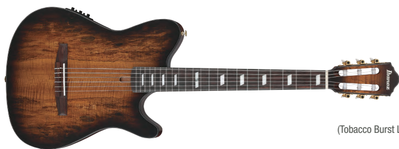
TCL (Tobacco Burst Low Gloss)