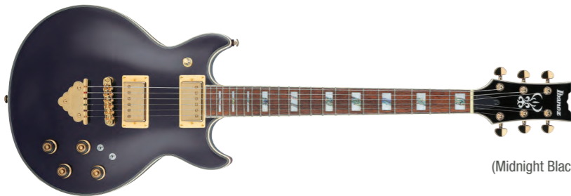
MBM (Midnight Black Metallic)