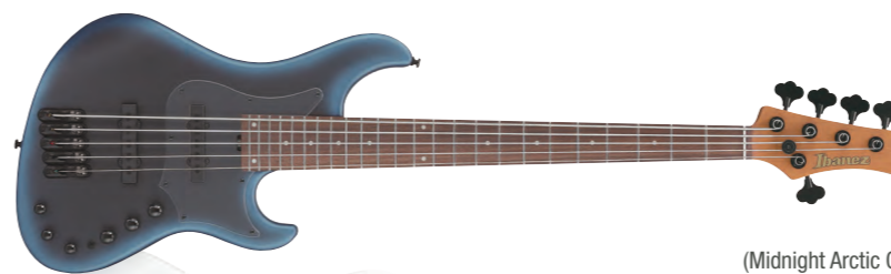
MAM (Midnight Arctic Ocean Matte)