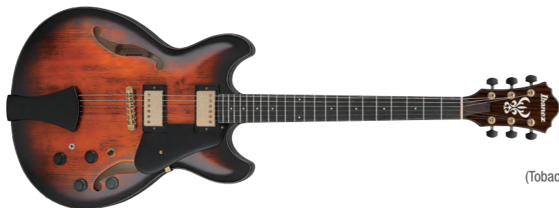
TBC (Tobacco Brown)