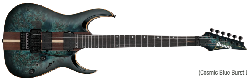
Premium CUL (Cosmic Blue Burst Low Gloss)