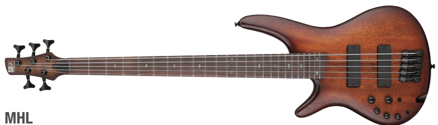
MHL (Mahogany Brown Burst Low Gloss)