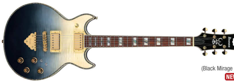
BMG (Black Mirage Gradation) NEW FINISH