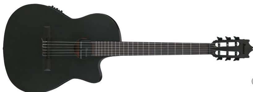
BOT (Black Out)