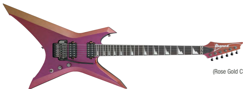
RGC (Rose Gold Chameleon)