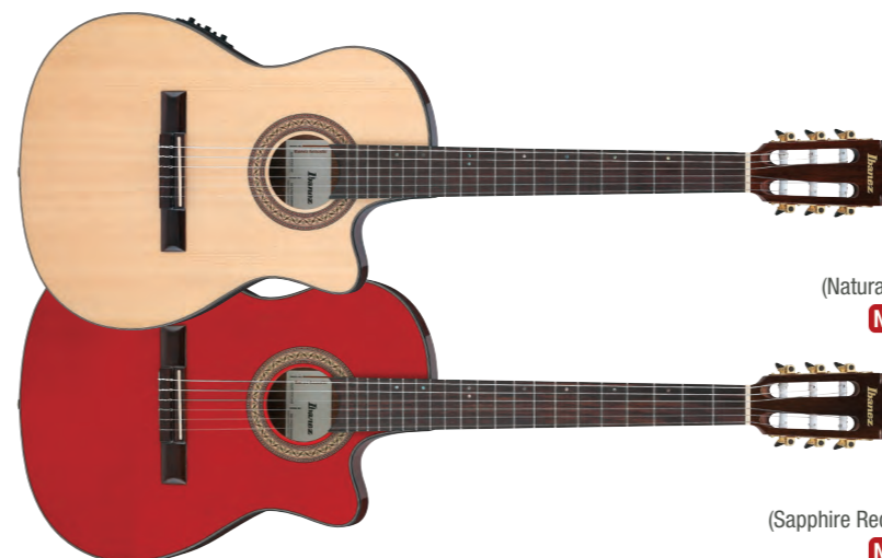
NT (Natural High Gloss) NEW FINISH