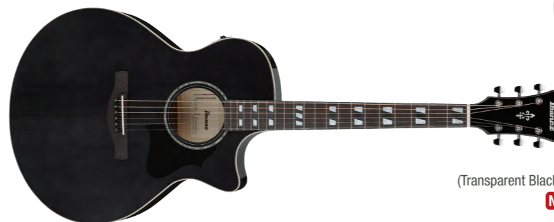
TBK (Transparent Black High Gloss) NEW FINISH