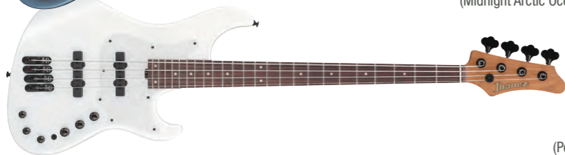
PW (Pearl White)