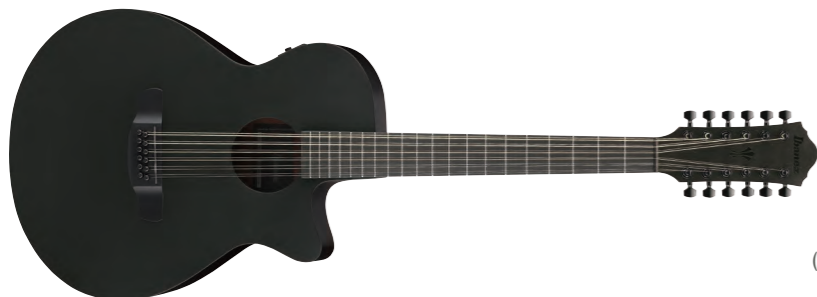
BOT (Black Out)