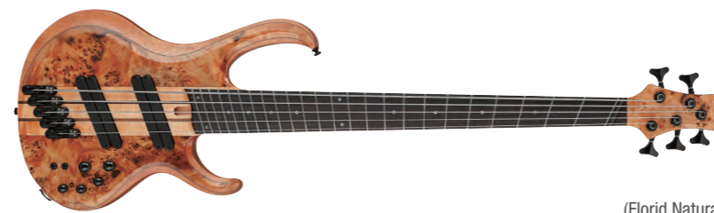
FNL (Florid Natural Low Gloss) NEW FINISH