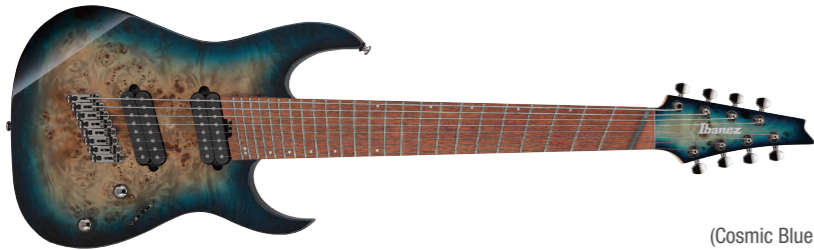
CBS (Cosmic Blue Starburst)