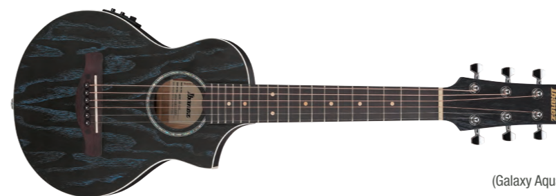
GAO (Galaxy Aqua Open Pore)