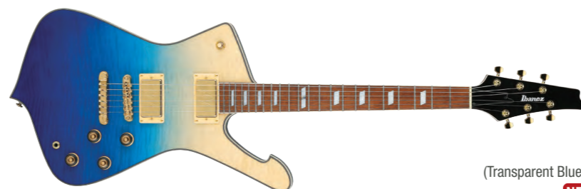
TBG (Transparent Blue Gradation) NEW FINISH