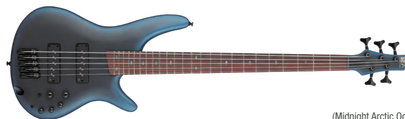
MAM (Midnight Arctic Ocean Matte)