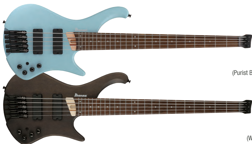
PRM (Purist Blue Matte)