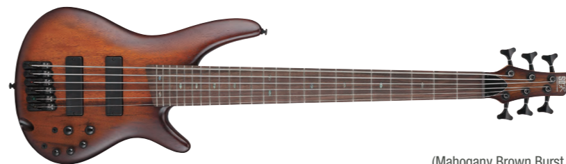
MHL (Mahogany Brown Burst Low Gloss)