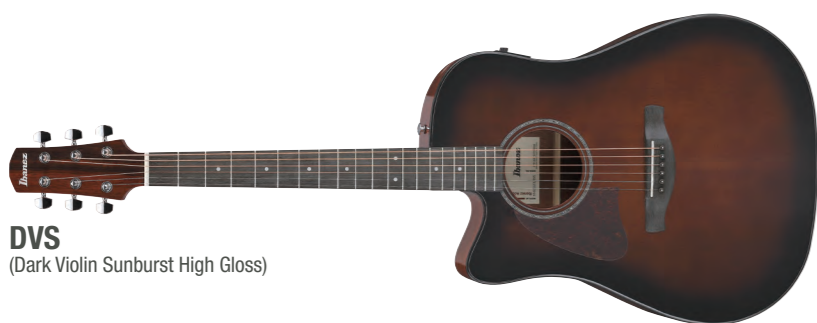
DVS (Dark Violin Sunburst High Gloss)