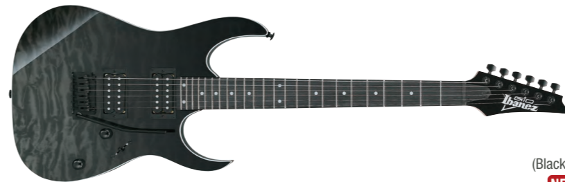
BKG (Black Gradation) NEW FINISH