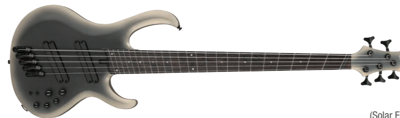
SOM (Solar Eclipse Matte) NEW FINISH