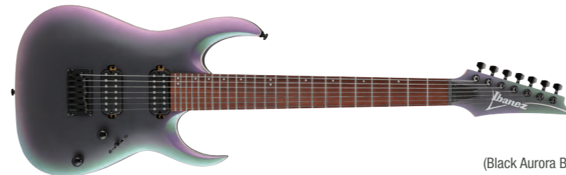
BAM (Black Aurora Burst Matte)