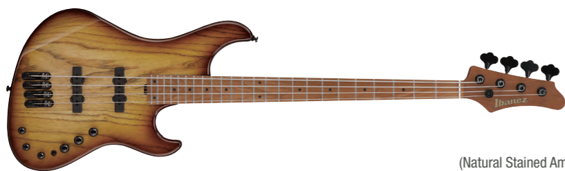
NAB (Natural Stained Amber Burst)