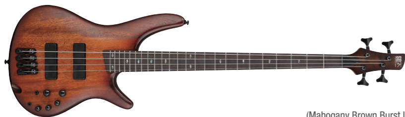
MHL (Mahogany Brown Burst Low Gloss)