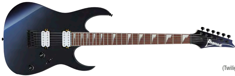
TWS (Twilight Shade)