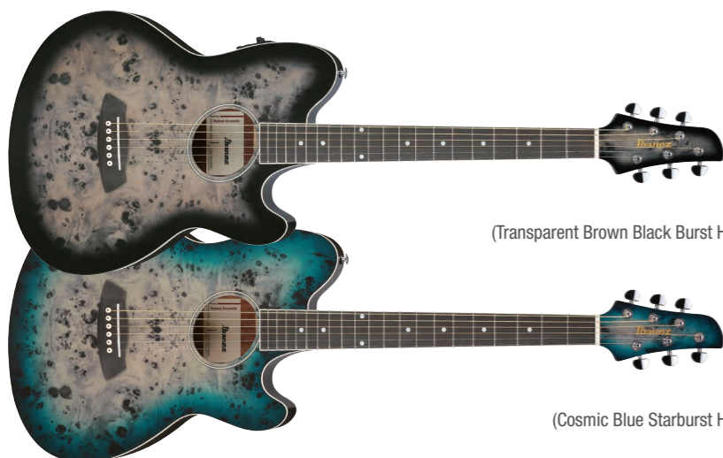
BKB (Transparent Brown Black Burst High Gloss)