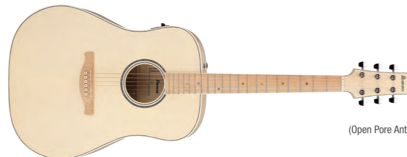
OAW (Open Pore Antique White)