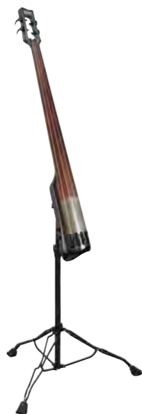
BUL (Black Ice Burst Low Gloss)