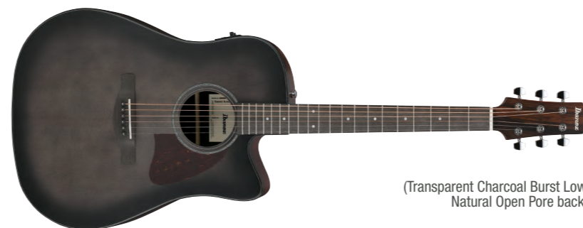
TBN (Transparent Charcoal Burst Low Gloss top, Natural Open Pore back and sides)