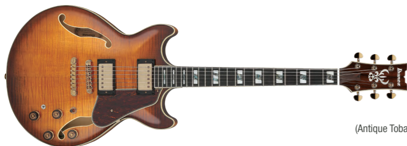
ATT (Antique Tobacco Burst)