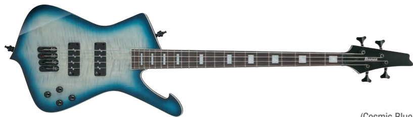
CBS (Cosmic Blue Starburst)