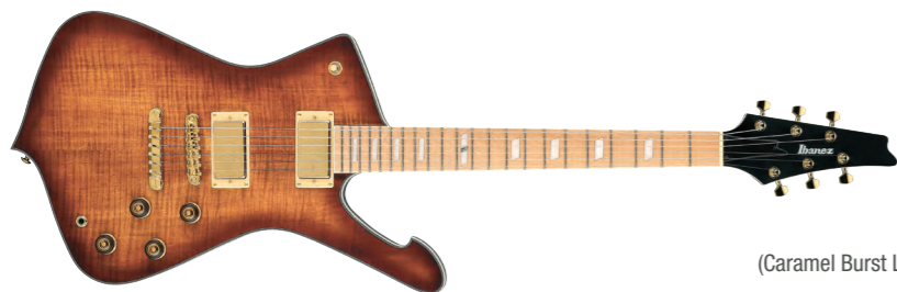
CML (Caramel Burst Low Gloss)