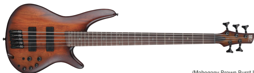
MHL (Mahogany Brown Burst Low Gloss)