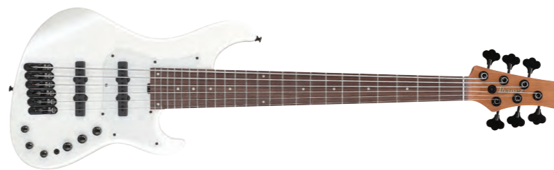
PW (Pearl White)