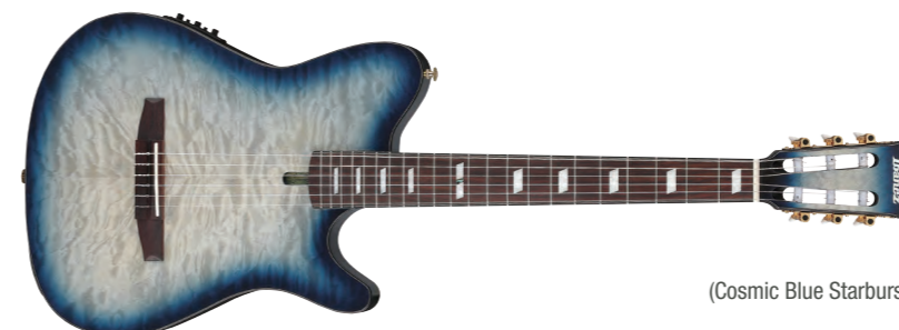
CTL (Cosmic Blue Starburst Low Gloss)