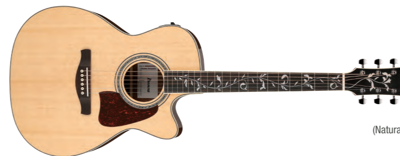
NT (Natural High Gloss)