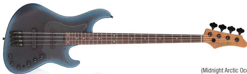
MAM (Midnight Arctic Ocean Matte)