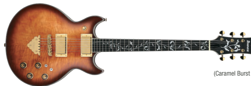
CML (Caramel Burst Low Gloss)