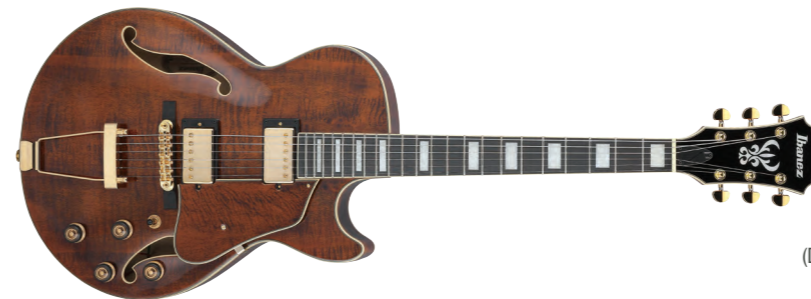
DA (Dark Amber)