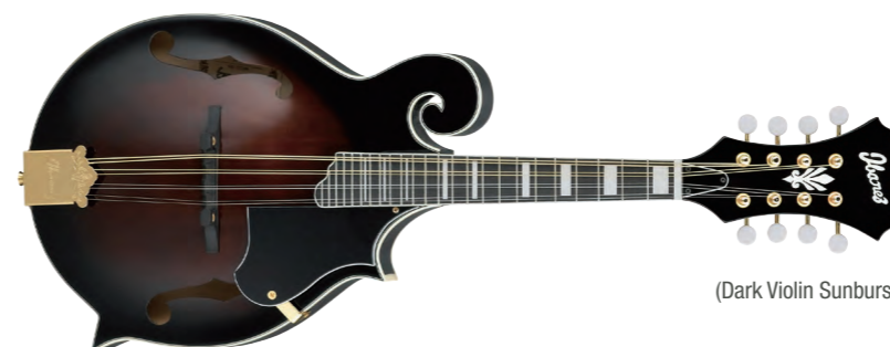
DVS (Dark Violin Sunburst High Gloss)