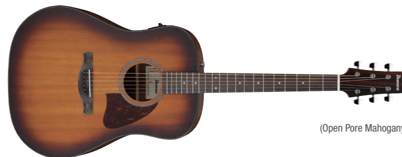
OMH (Open Pore Mahogany Sunburst)