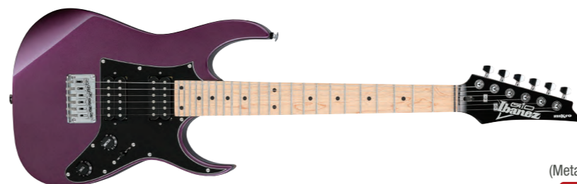
MPL (Metallic Purple) NEW FINISH