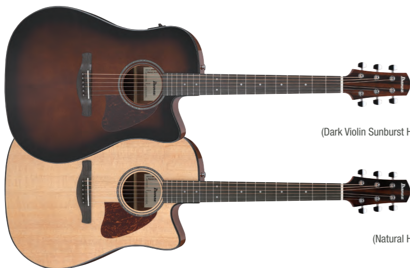
DVS (Dark Violin Sunburst High Gloss)