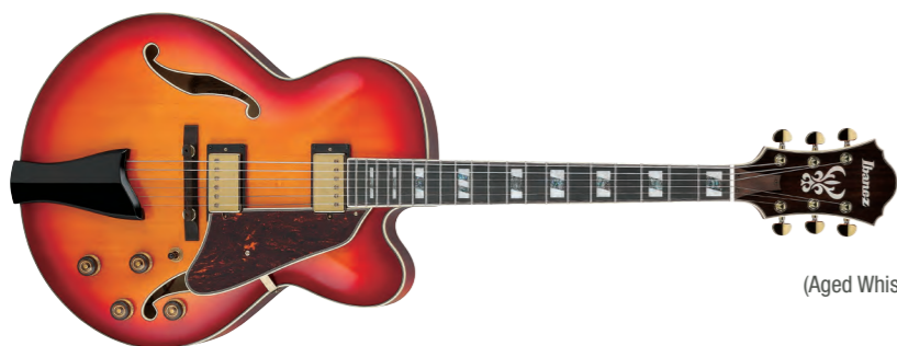
AWB (Aged Whiskey Burst)