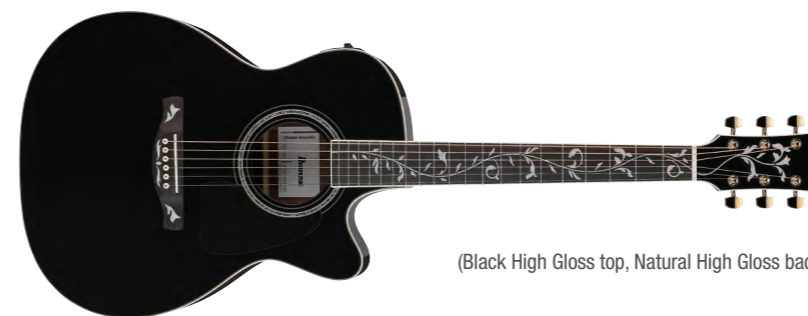
BKH (Black High Gloss top, Natural High Gloss back and sides)