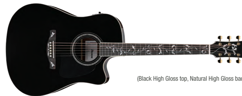
BKH (Black High Gloss top, Natural High Gloss back and sides)