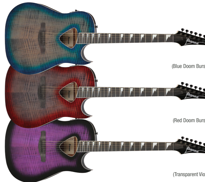
BDB (Blue Doom Burst High Gloss)