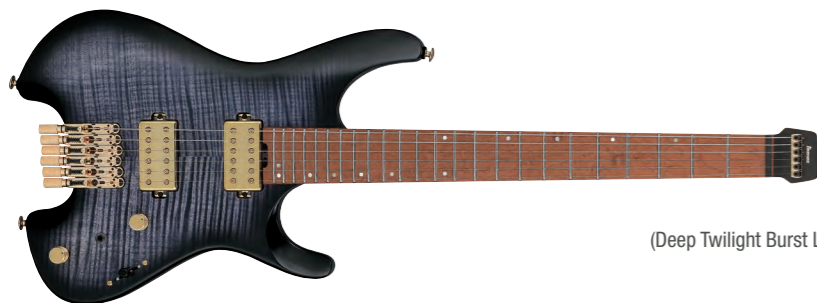
DRL (Deep Twilight Burst Low Gloss)