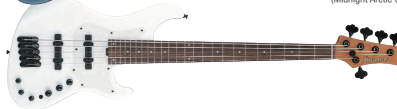
PW (Pearl White)