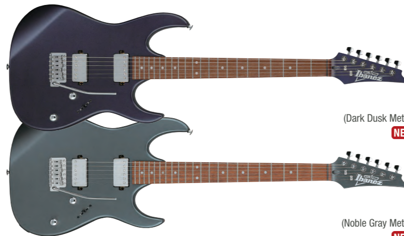
DDM (Dark Dusk Metallic Matte) NEW FINISH