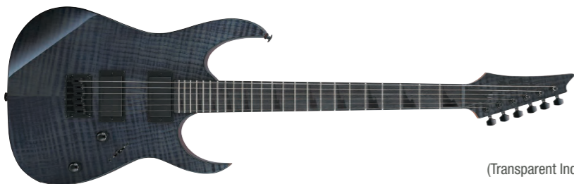
TDK (Transparent Indigo Black)