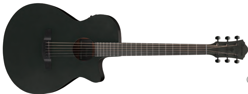
BOT (Black Out)