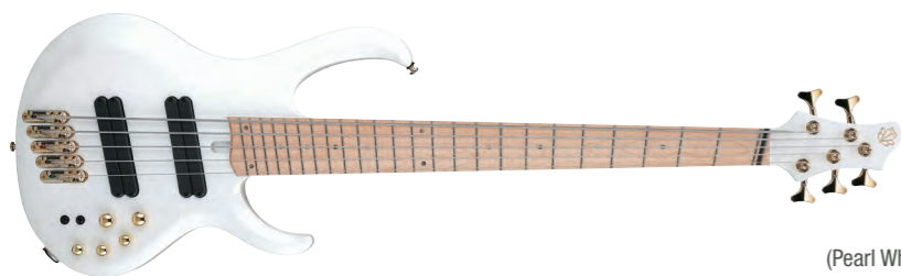
PWM (Pearl White Matte)